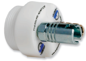
BB Pressure Adaptor with Bayonet fitting - LPA100BP