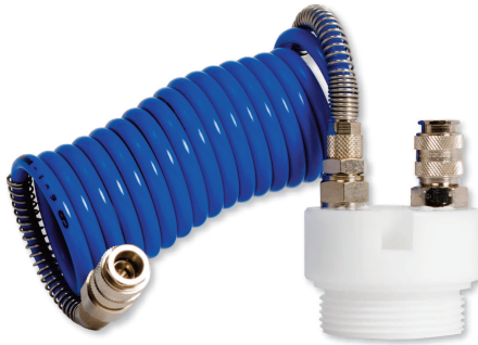
BB Pressure Adaptor-Recoil Hose - LPA100PR