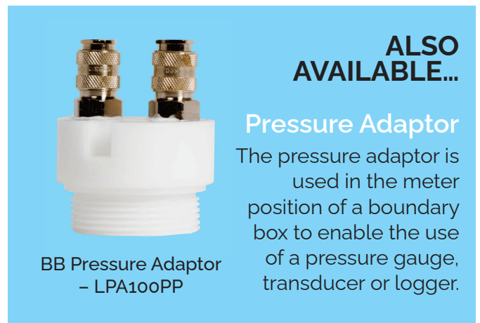
BB Pressure Adaptor – LPA100PP

ALSO AVAILABLE... Pressure Adaptor The pressure adaptor is used in the meter position of a boundary box to enable the use of a pressure gauge, transducer or logger.