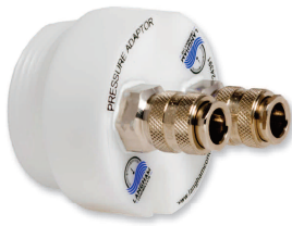
BB Pressure Adaptor - LPA100PP